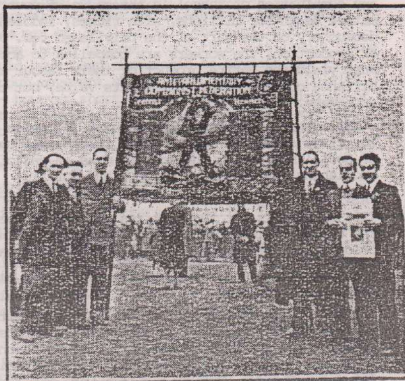
RIGHT: Some members of the APCF (date unknown). The banner reads: 'Anti-Parliamentary Communist Federation Central Branch'.